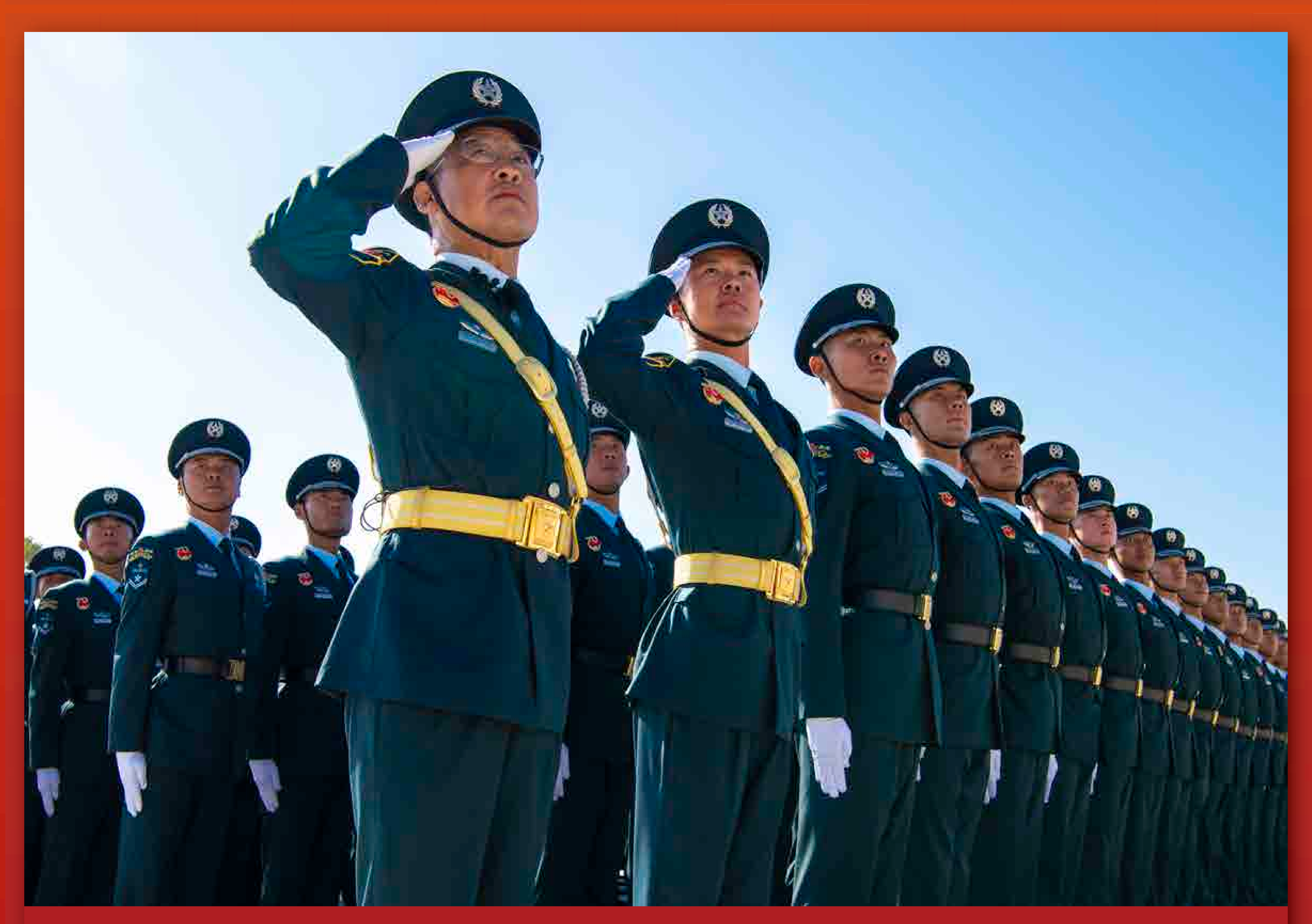
建立统一的文职人员制度,扩大文职人员编配范围,延揽社会优秀人才为军队建设服务。图为参加庆祝中华人民共和国成立 70 周年阅兵的文职人员方队。

The Interim Regulations on Non-commissioned Officers and the related laws and regulations have come into force, in an effort to enhance the professionalism and stability of the NCO corps and ensure that the NCOs are loyal to the Party, professional, dedicated and of fine conduct. The photo shows a unit of the PLA Rocket Force holding a promotion ceremony for master sergeants first class.