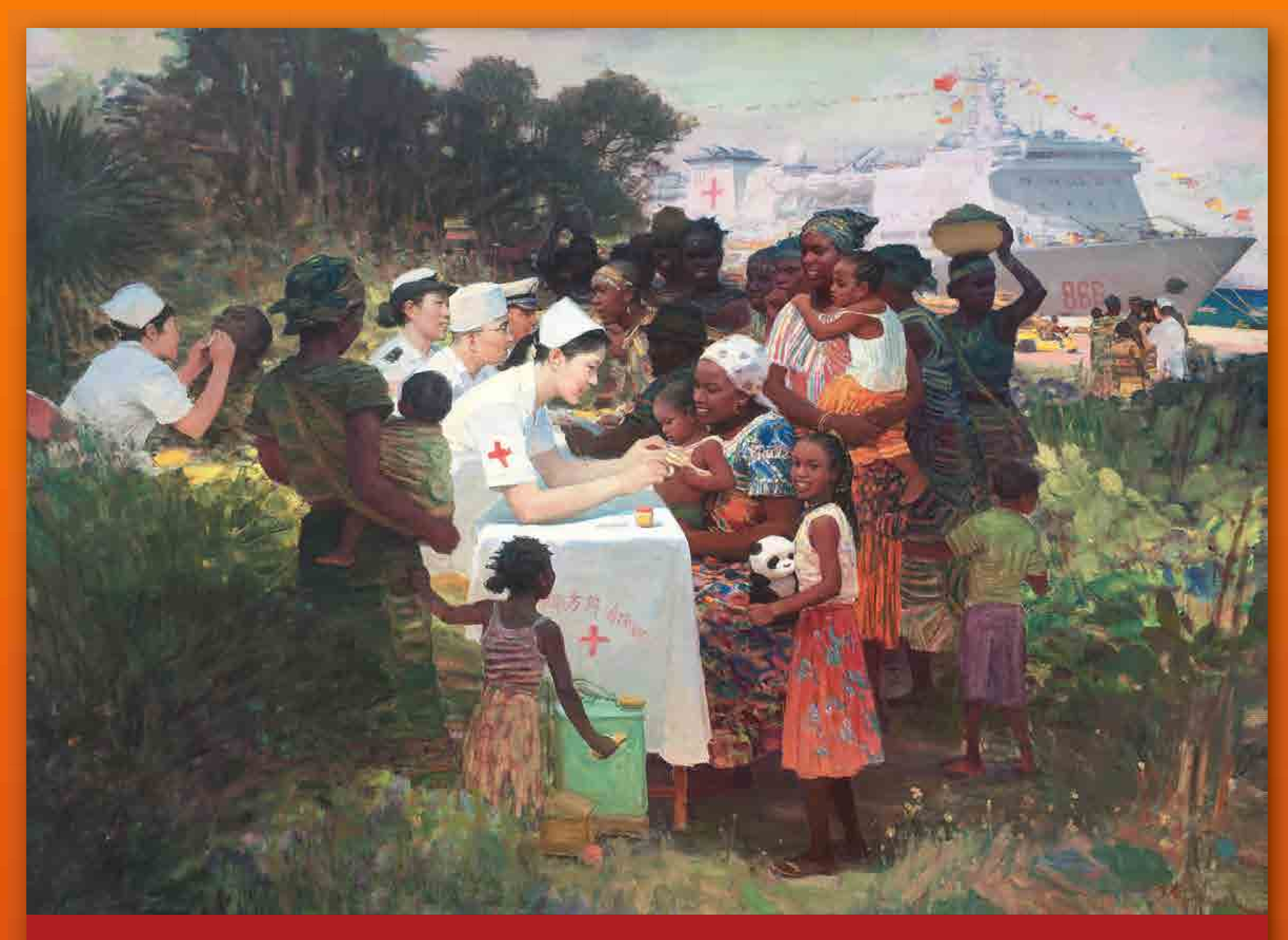
中国海军"和平方舟"号医院船入列以来,以"和谐使命"任务为主要载体,远赴海外开展人道主义医疗服务。 截至 2019 年,先后 9 次走出国门,航行 24 万余海里,服务 43 个国家和地区、23 万余人次。

Since it was commissioned, the PLAN hospital ship Ark Peace has fulfilled voyages code-named "Mission Harmony" and provided humanitarian medical services overseas. By 2019, it has conducted 9 overseas operations, sailing more than 240,000 nautical miles, providing services to 43 countries and regions and to over 230,000 people.