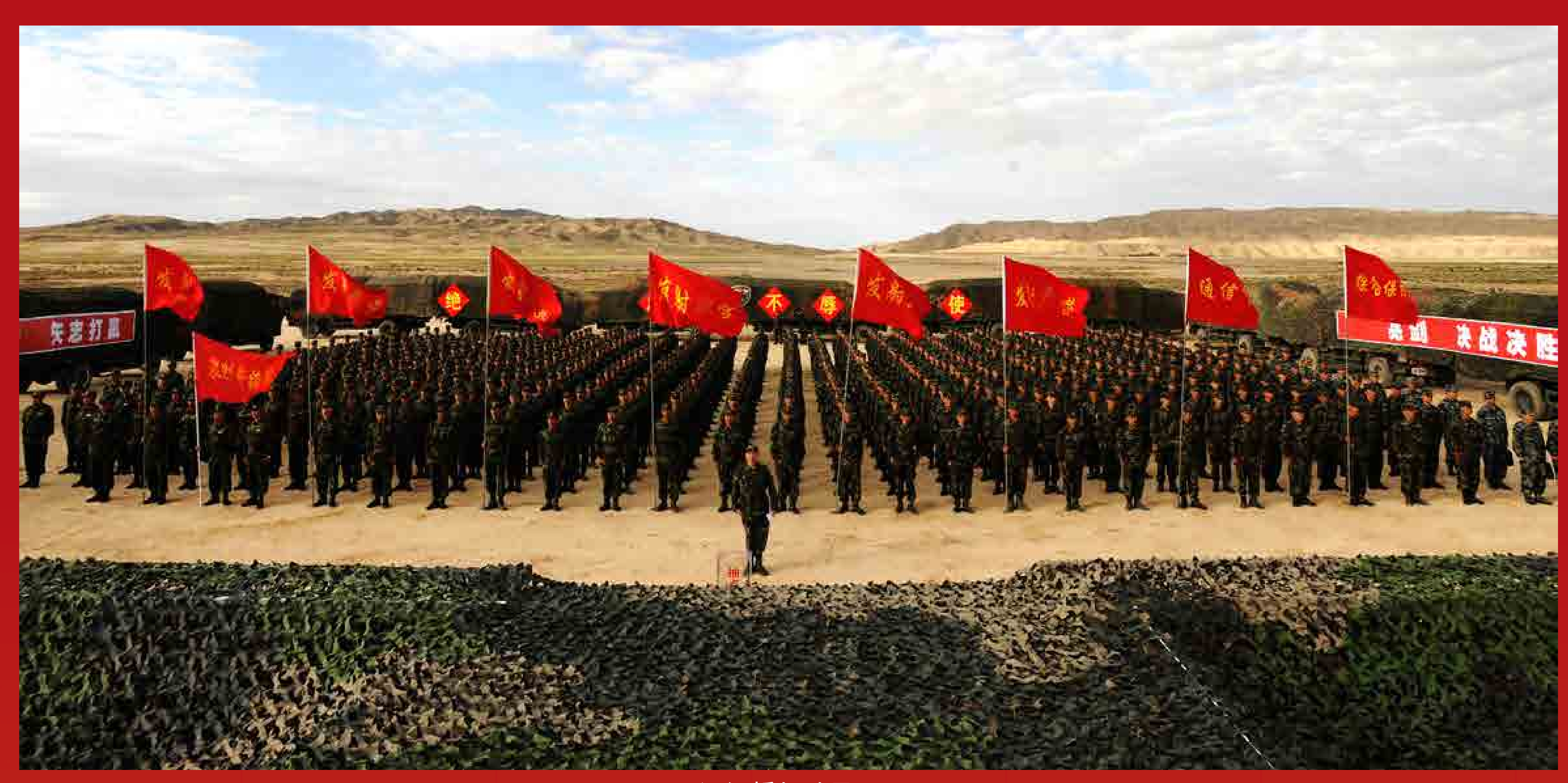
组织誓师动员 A mobilization ceremony