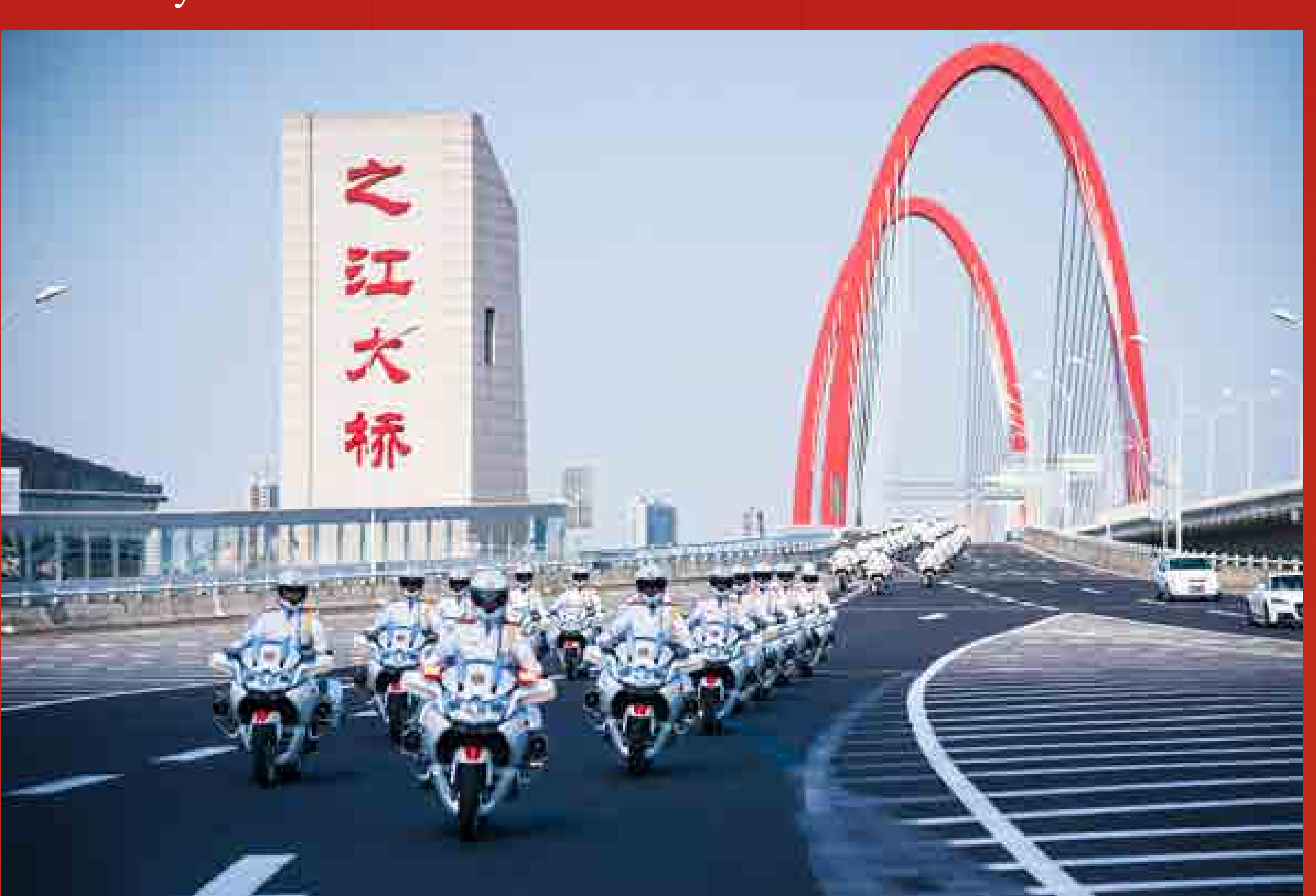
军容严整执行 G20 峰会国宾护卫任务 Escorting state guests at the G20 Summit in gallant array