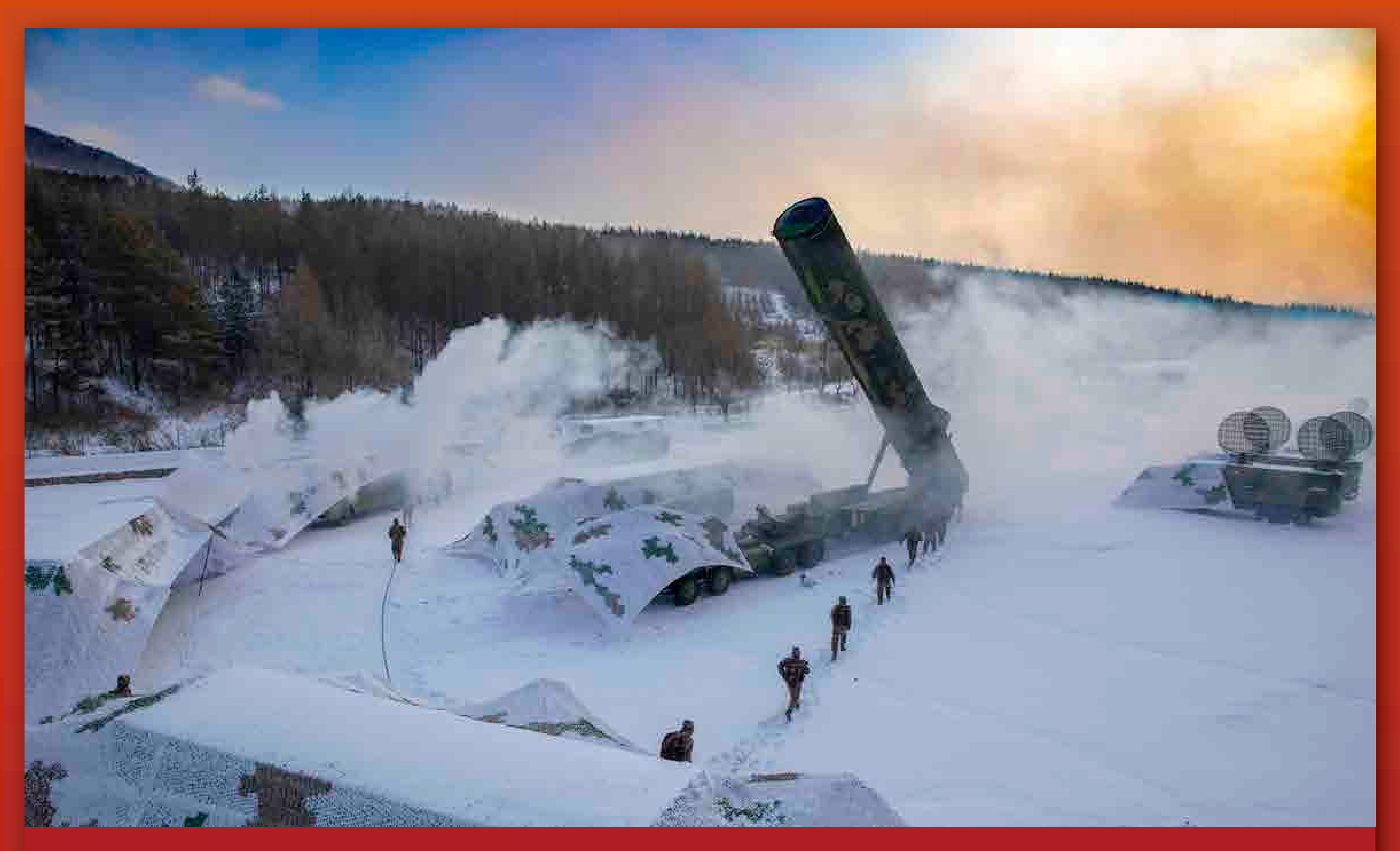
积极构设逼真战场环境,加大实兵对抗演练难度强度。图为某导弹旅在严寒环境下开展战斗发射演练。 Real combat conditions have been created to enhance the difficulty and intensity of force-on-force exercises. The photo shows a PLARF missile brigade conducting launch training in a frigid environment.

China's armed forces insist on training for combat and promoting combat capability through training so as to train in accordance with actual combat requirements and integrate military training with real combat. The photo shows a PLAAF Golden Helmet pilot conducting confrontation training in a new type of indigenous fighter aircraft.