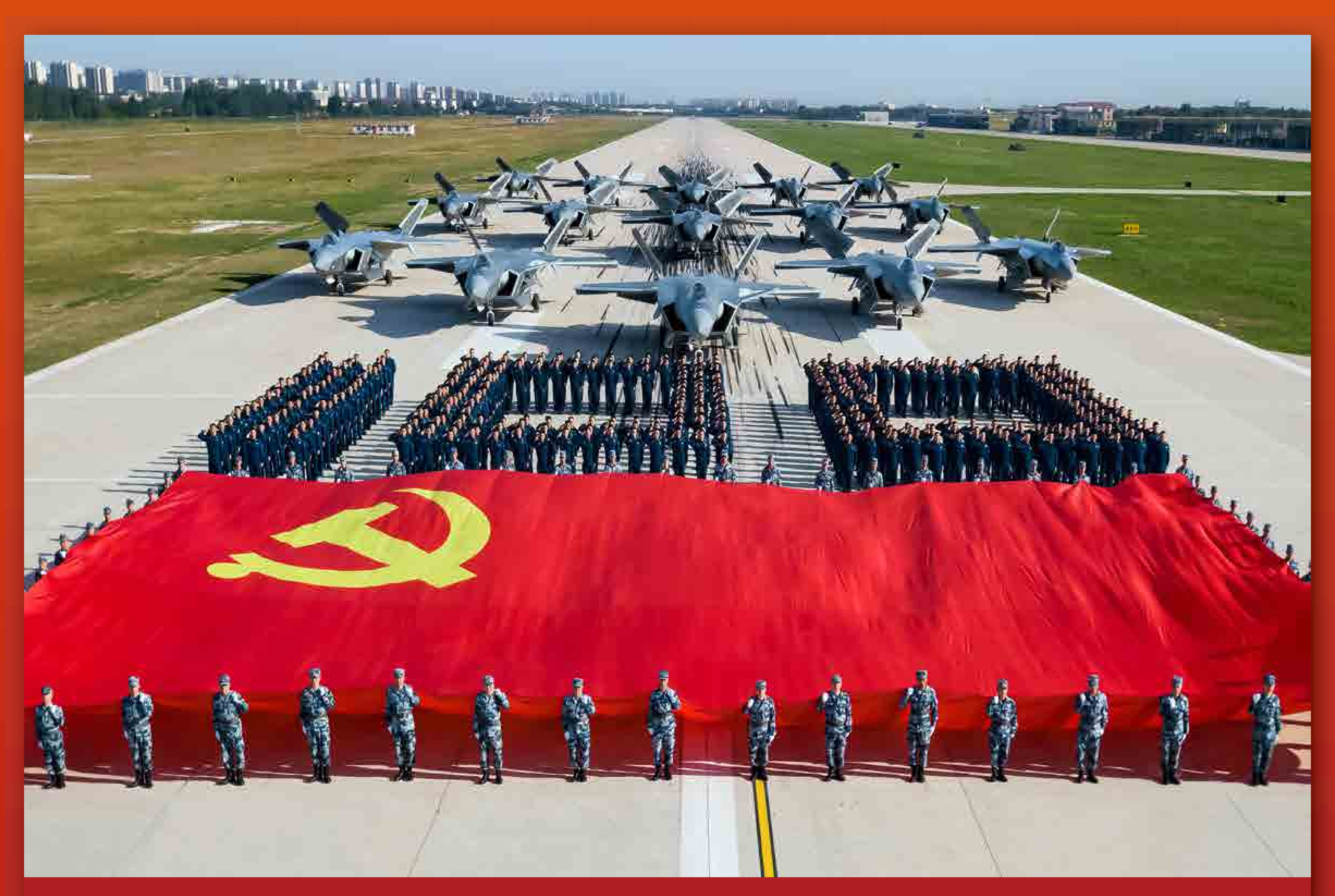
全军部队深入开展党史学习教育,从中汲取奋斗强军力量。图为空军某部官兵在参加庆祝中国共产党成立 100 周年飞行 表演的歼-20 飞机见证下重温入党誓词。

China's armed forces fully implement the CMC chairman responsibility system and resolutely follow the leadership of the CPC Central Committee, the CMC and President Xi. The photo shows that PLA officers and soldiers attended an exhibition themed on Marching under the Banner of the Party: The People's Military Celebrating the Centenary of the CPC.