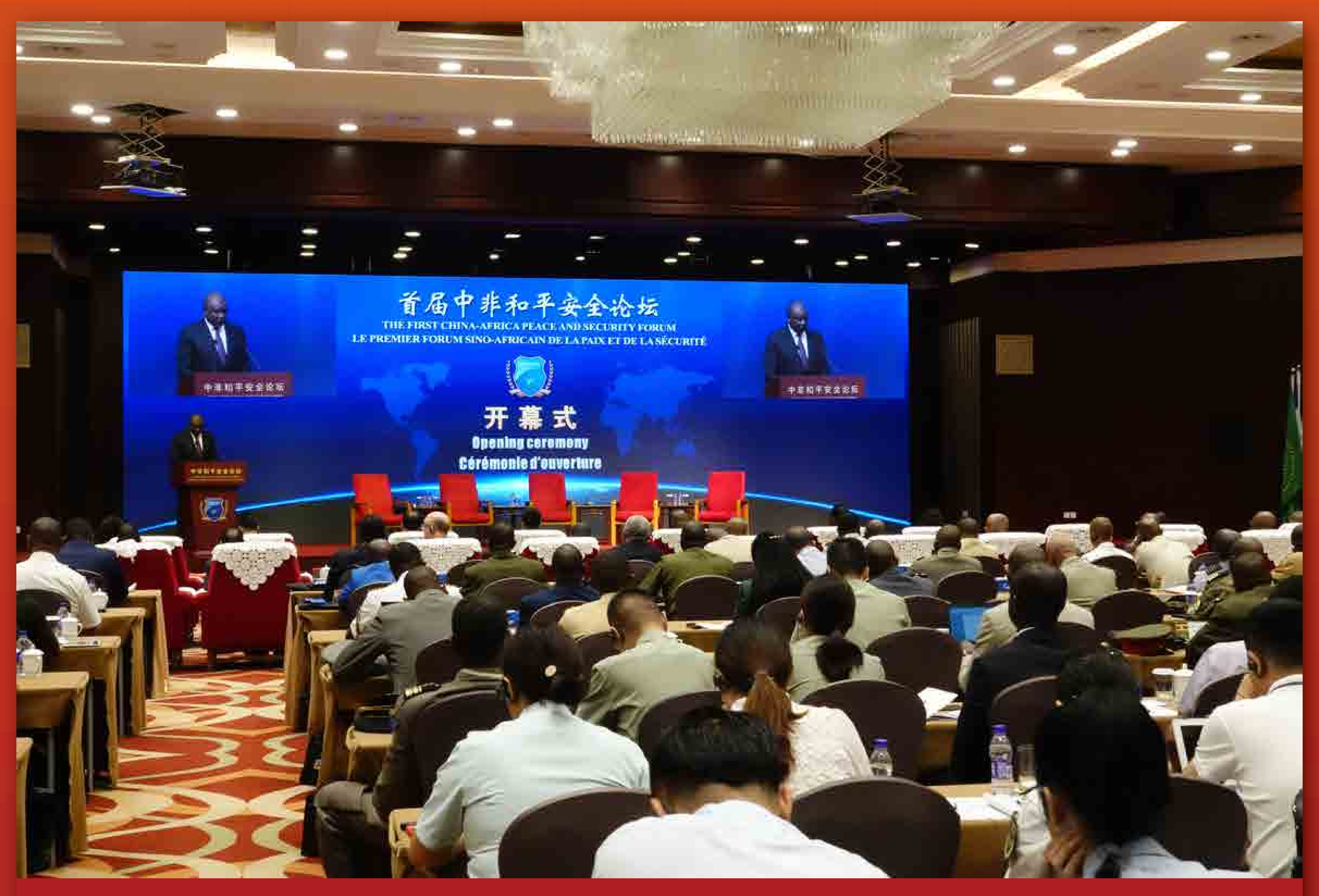
加强同发展中国家的团结合作,广泛开展军事交往和专业交流。图为 2019 年 7 月,中国国防部在北京举办首届中 非和平安全论坛。

China's armed forces have actively participated in regional security dialogues and promoted multilateral security cooperation mechanisms, making important contributions to regional security and stability. In October 2019, the 9th Beijing Xiangshan Forum was held. The photo shows the forum site.