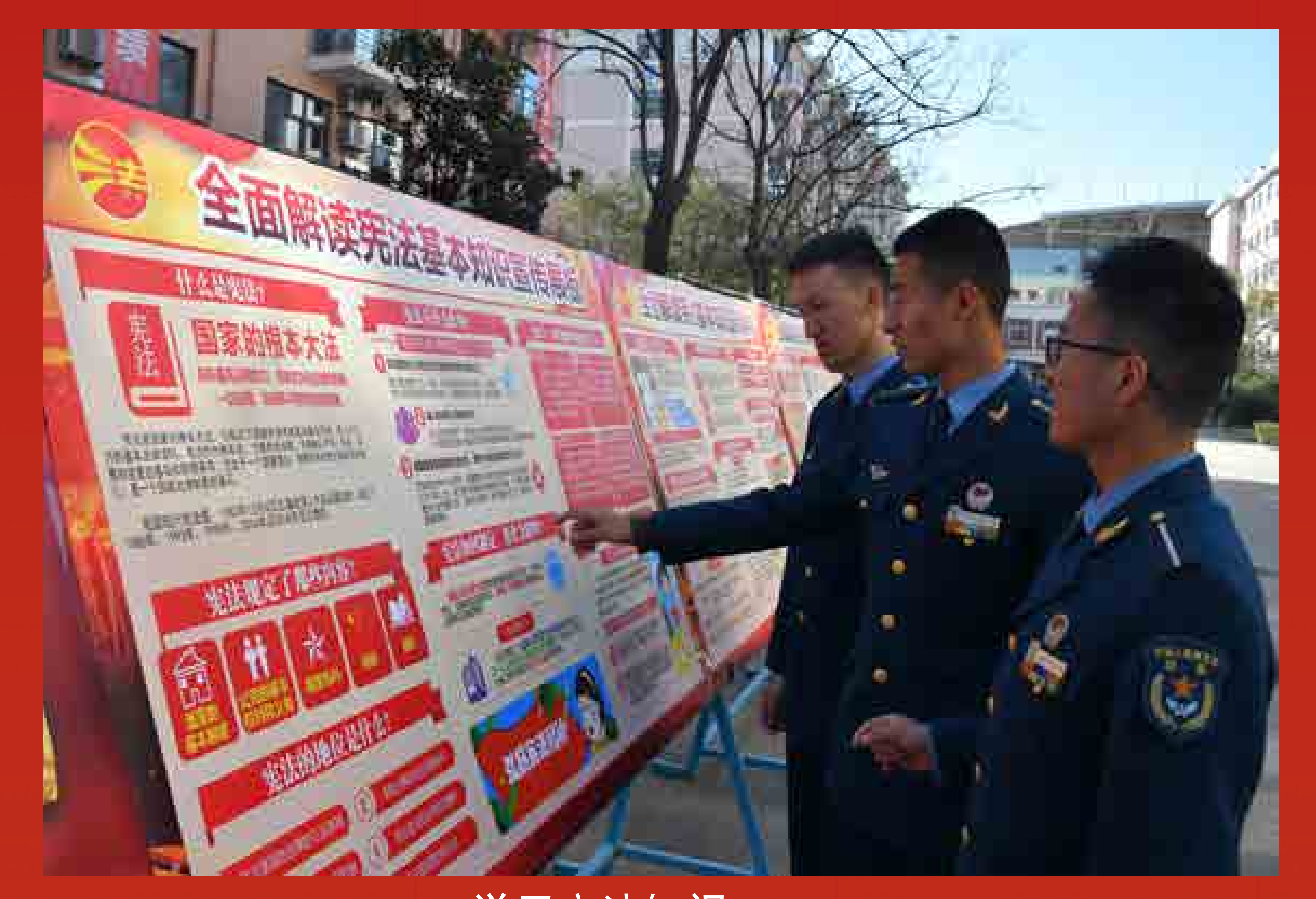
学习宪法知识 Studying the Constitution of the PRC