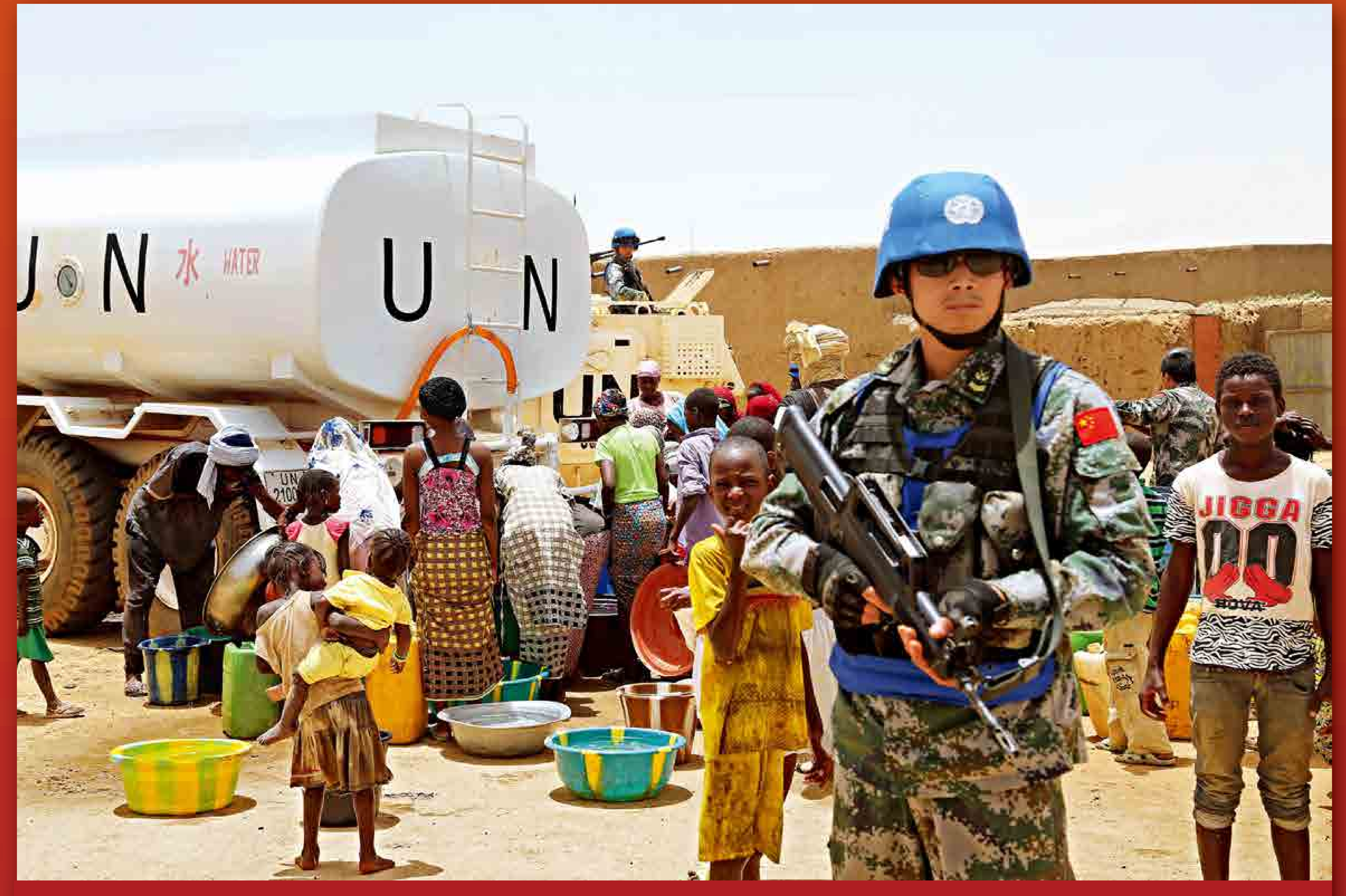
中国维和官兵是和平的守护人、友谊的传播者,他们用实际行动为遭受战火摧残的人民带去了和平、点亮了希望。 图为第 4 批赴马里维和部队警卫分队为当地群众送水。

Since it was commissioned, the PLAN hospital ship Ark Peace has fulfilled voyages code-named "Mission Harmony" and provided humanitarian medical services overseas. By 2019, it has conducted 9 overseas operations, sailing more than 240,000 nautical miles, providing services to 43 countries and regions and to over 230,000 people.