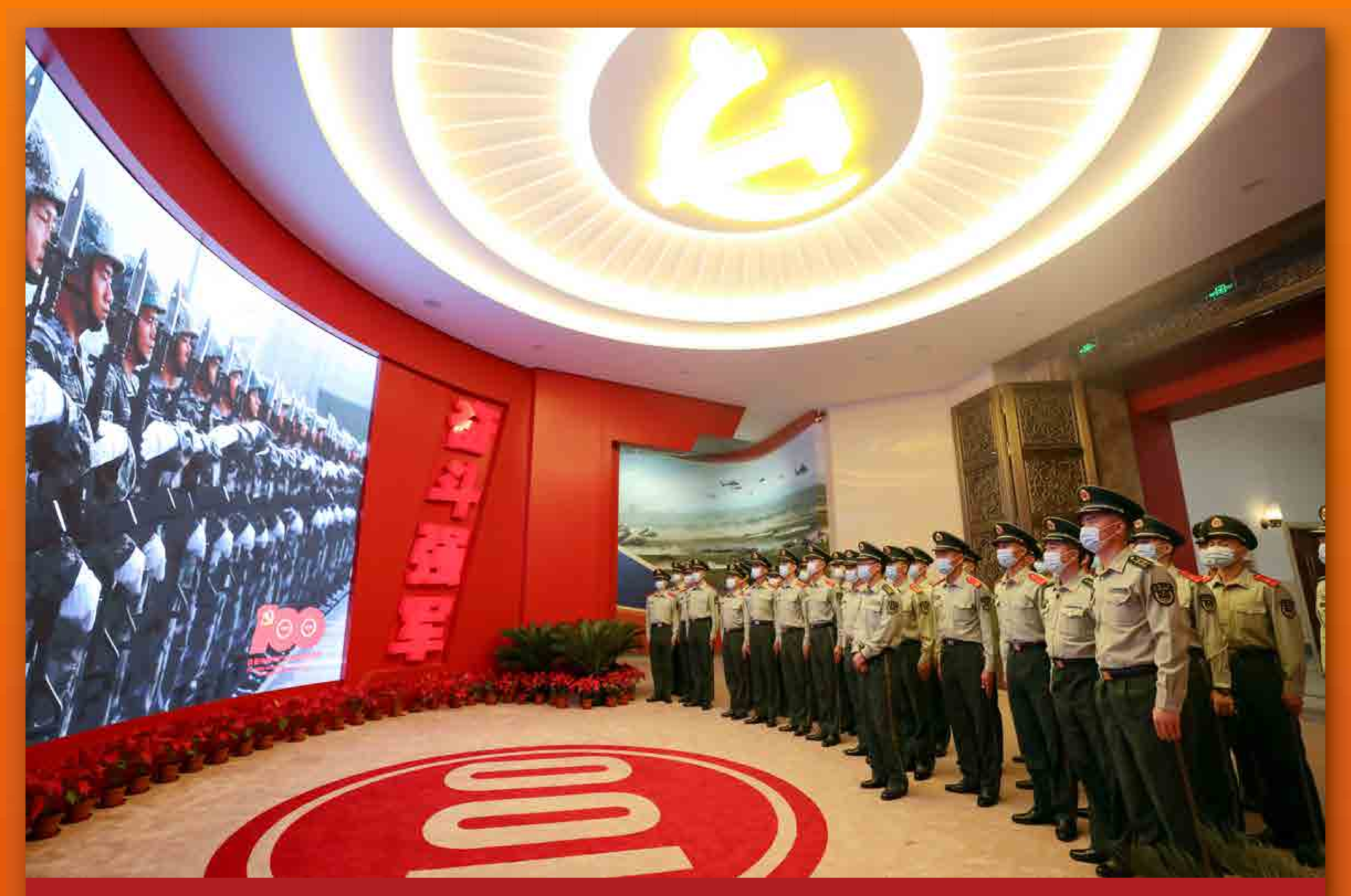
全军深入贯彻军委主席负责制,坚决听从党中央、中央军委和习主席指挥。图为某部官兵组织参观"在党的旗帜下前进——人民军队庆祝中国共产党成立 100 周年主题展览"。

China's armed forces fully implement the CMC chairman responsibility system and resolutely follow the leadership of the CPC Central Committee, the CMC and President Xi. The photo shows that PLA officers and soldiers attended an exhibition themed on Marching under the Banner of the Party: The People's Military Celebrating the Centenary of the CPC.