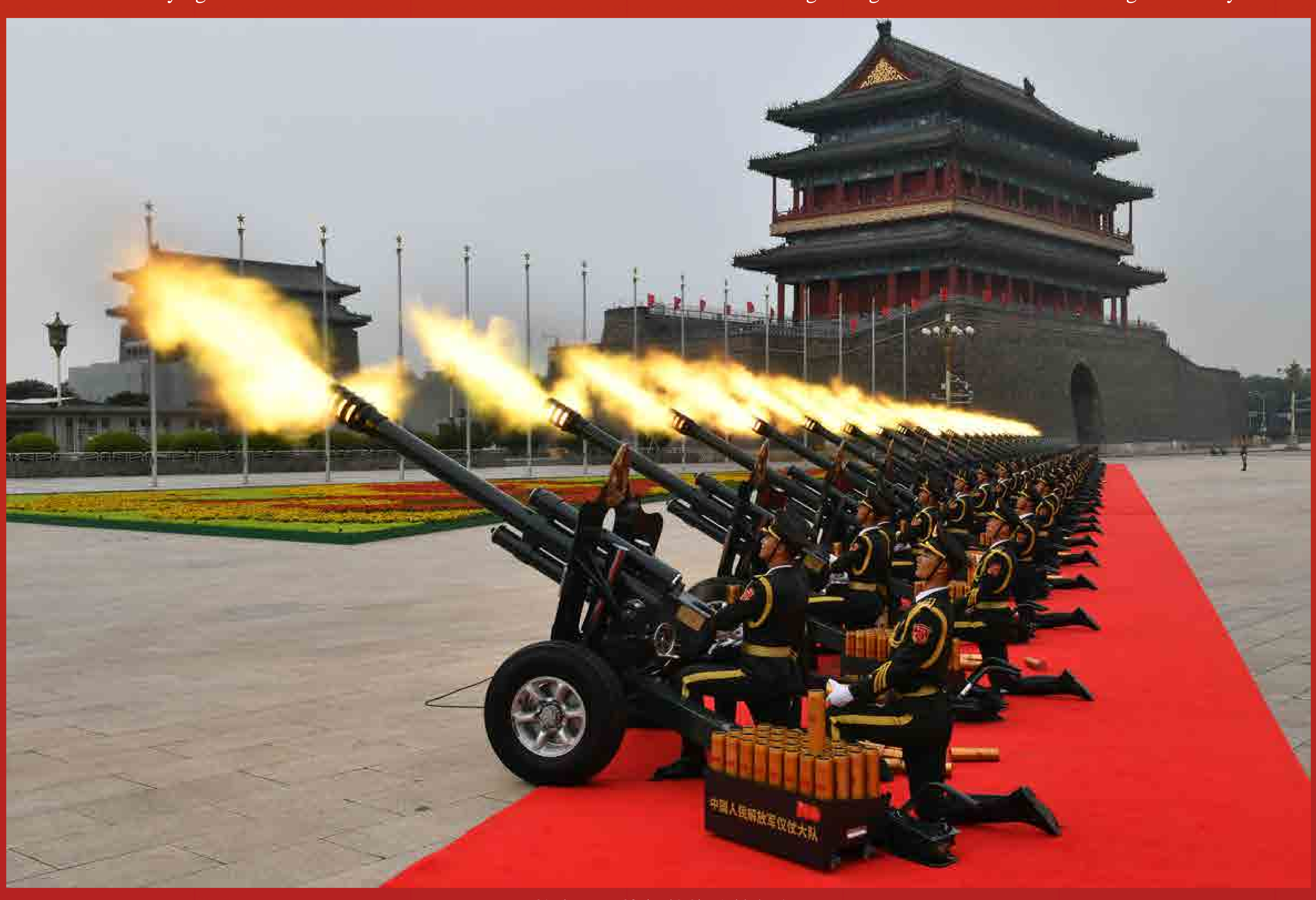
整齐划一执行礼炮鸣放任务 Firing the gun salute in concerted action

军队越是现代化,越是信息化,越是要法治化。贯彻依法治军战略,加快治军方式根本性转变,不断提高国防和军队建设法治化水平。