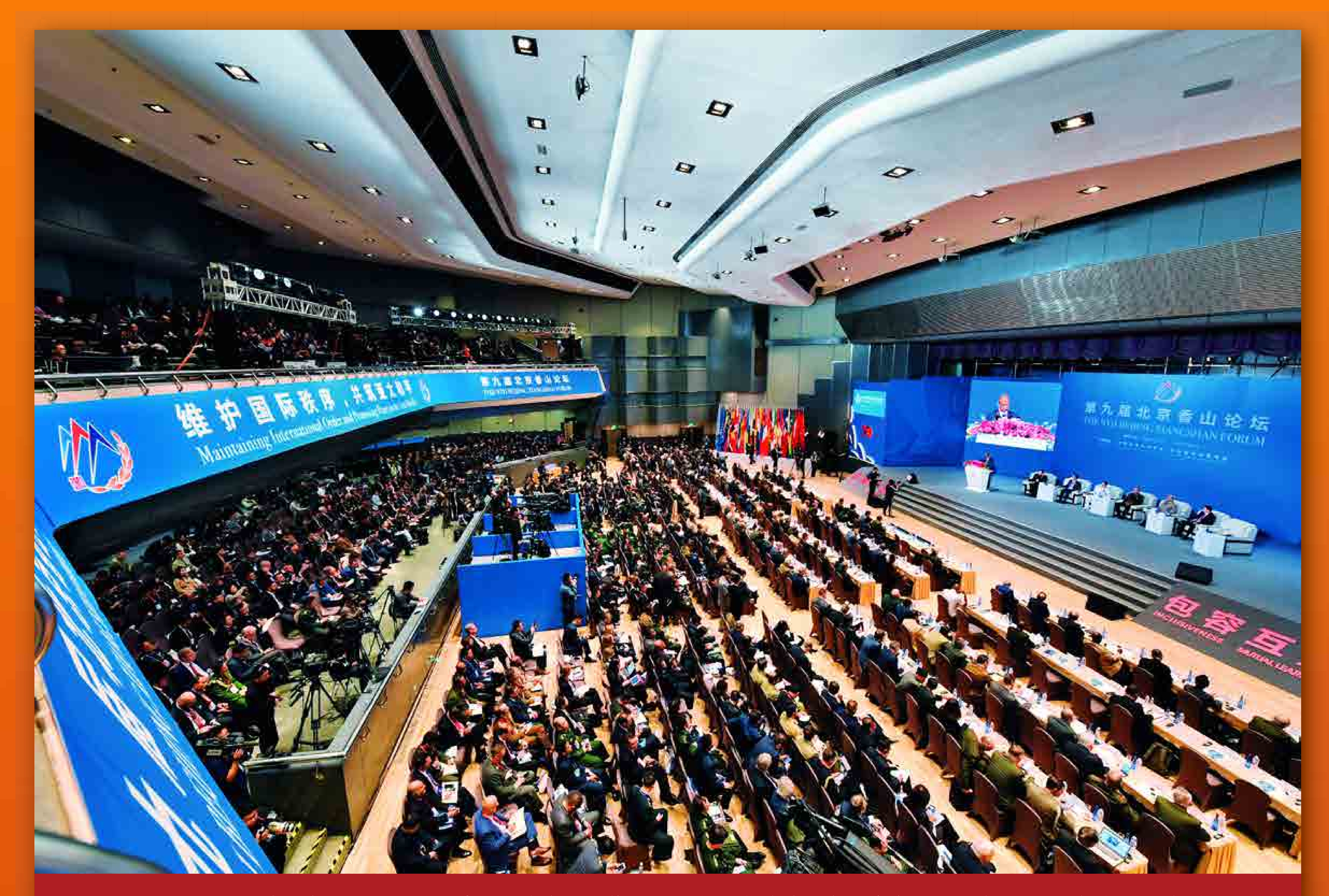
积极参与地区安全对话,推动建立多边安全合作机制,有力维护地区安全稳定。2019 年 10 月,第九届北京香山论坛举行。图为论坛现场。

China's armed forces have actively participated in regional security dialogues and promoted multilateral security cooperation mechanisms, making important contributions to regional security and stability. In October 2019, the 9th Beijing Xiangshan Forum was held. The photo shows the forum site.